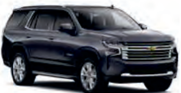
Dark Ash Metallic – G6M