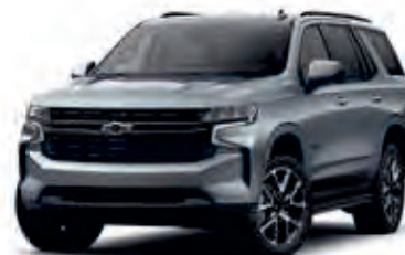
Sterling Grey Metallic - GXD