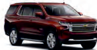
Auburn Metallic – G48