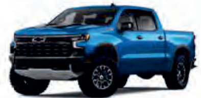
Glacier Blue Metallic – GLT