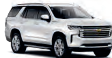
Iridescent Pearl Tricoat – G1W