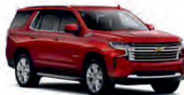
Radiant Red Tintcoat – GNT