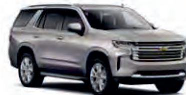
Empire Beige Metallic – GJW