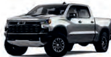
Sterling Gray Metallic – GXD