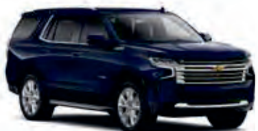
Midnight Blue – GLU