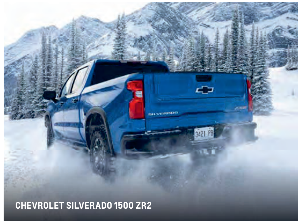
CHEVROLET SILVERADO 1500 ZR2