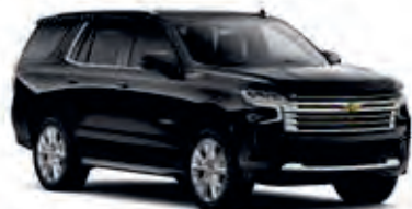
Black – GBA