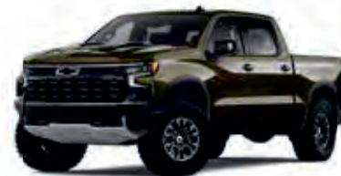
Harvest Bronze Metallic – GXN