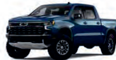
Lakeshore Blue Metallic – GXP