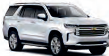
Summit White – GAZ