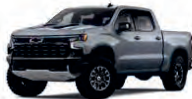
Slate Gray Metallic – GNO